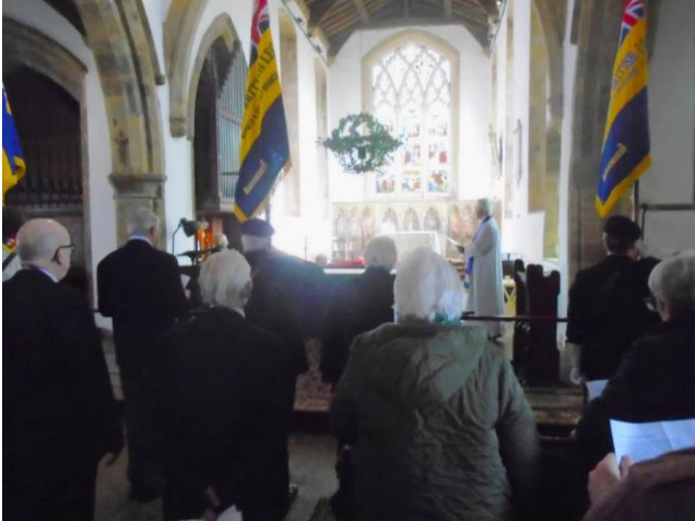
The Standards at the Chancel step

The final act for our branch was the ceremony to lay-up our current Branch Standard in Byfield's Holy Cross church on Sunday 3 rd March 2024. As the Legion rules state no more than one type of standard can be displayed together, our previously retired Branch Standard will therefore be transferred to the care of the Woodford Halse Archive Trust for preservation. That Trust looks after various artefacts of historical interest for villages in our area.