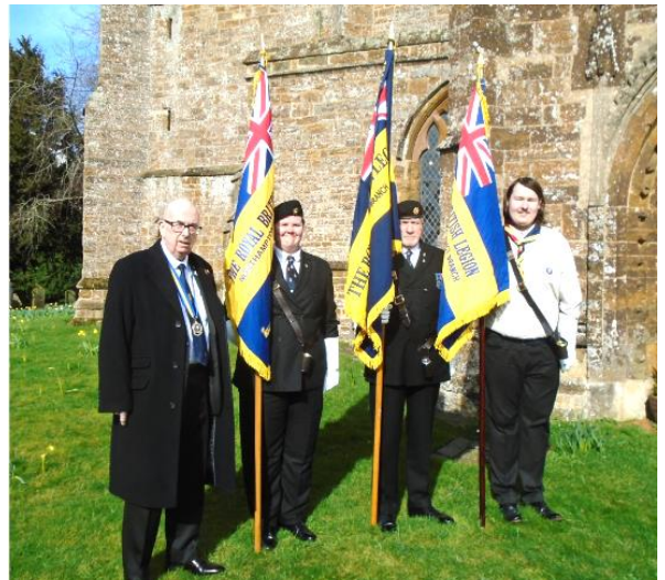
The County Chairman, County Standard, Byfield Standard and the Middleton Cheney Standard